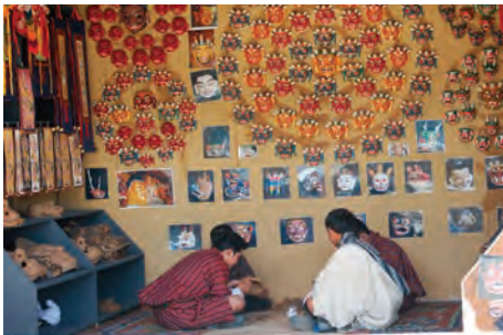
Young boys making masks for sale