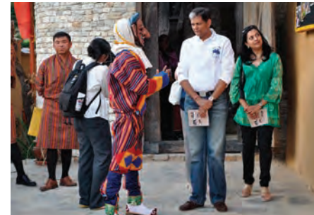
Atsara Guide escorting the tourists through Simply Bhutan