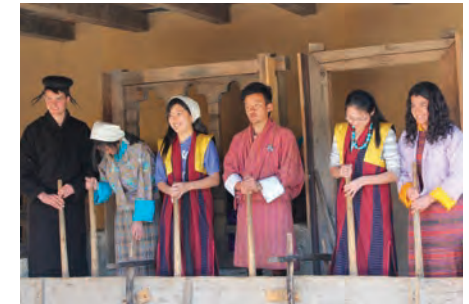
Pachham – building mud walls with sing song rhythm