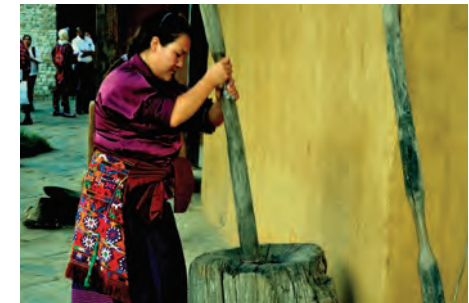
Pounding cereal the old way