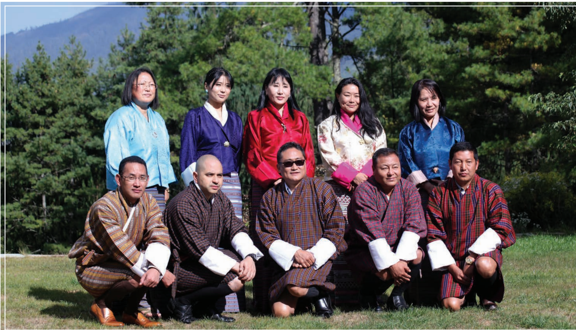
Her Majesty The Queen Mother Ashi Tshering Pem Wangchuck, President of YDF and Her Royal Highness Ashi Chimi Yangzom Wangchuck with the Board of Directors