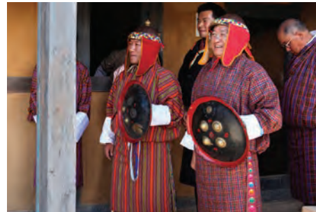
Traditional /indigenous costumes

The income generated from the entrance fees will go towards sustaining the project and also provide funds to support other YDF programs. The project has also trained over 100 school leavers seeking jobs while at the same time providing them with hands on experience.