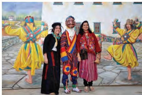
Photographing with indigenous costumes in front of the Festival Backdrop