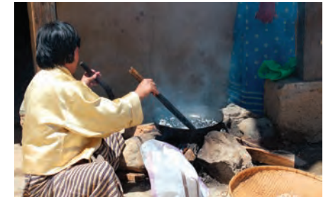
Making Zaw 'roasted rice'