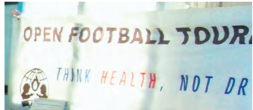
DIC Bumthang organised a football tournament under the theme of ‘Think Health, Not Drugs’ for the Bumthang community.

Besides the training of over 350 clients at the DICs and 150 clients at the rehab centre in the basics of information technology, YDF, in partnership with the National Institute of Information Technology (NIIT) India, launched the IT diploma scholarship for 12 needy youth. Annually, 4 youth will be sent to NIIT Training Centre in Kolkata for 3 years. With an objective to empower youth in IT, two IT playground learning stations have been installed at the Nazhoen Pelri complex.